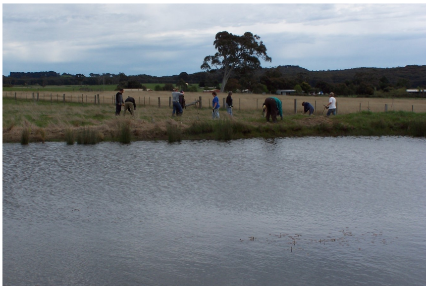
Planting around farm dam at Sally Stabback's property overlooking the lovely Cobaw state forest.

Well done to Sally and all who attended the day.