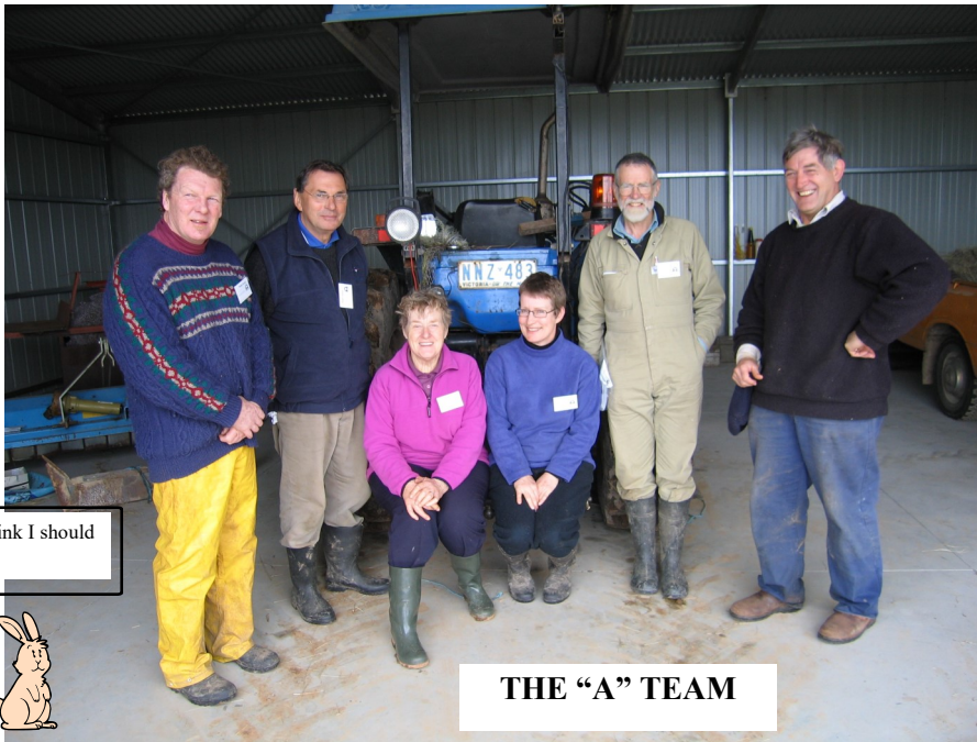
THE "A" TEAM

The AGM was attended by 22 people – quite amazing given the miserable weather and the shed venue!