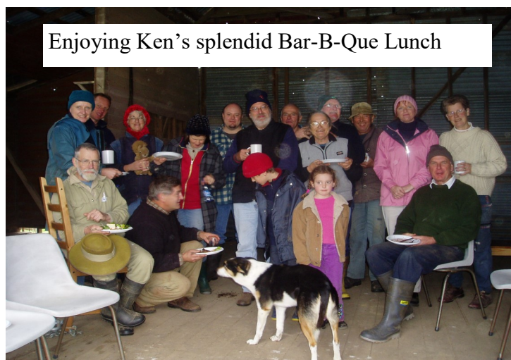
Enjoying Ken’s splendid Bar-B-Que Lunch

Whilst the area had not been sprayed the grass was short and the soil rich and damp which enabled us to scalp the soil easily with mattocks and then use Hamilton planters for the holes. The real bonus for the day was having our own 600 litre spray trailer available for the first time which we used to water the plants.