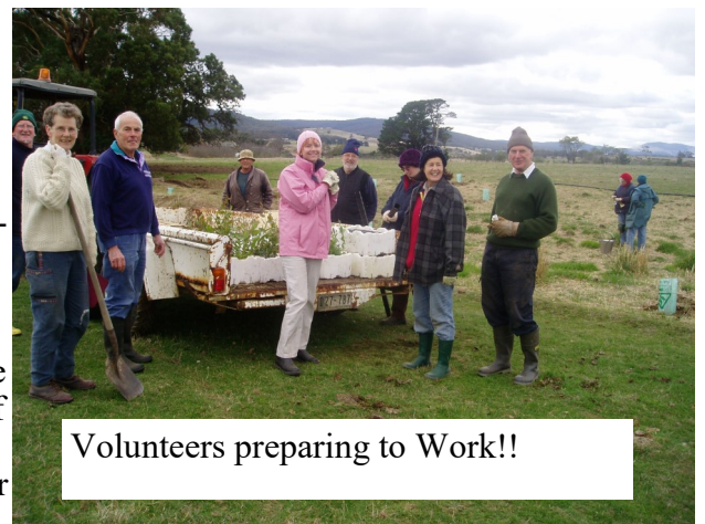
Volunteers preparing to Work!!

This will enhance water quality and also contribute to the vegetation corridor that runs across the along the ridge of the Jim Jim [ part of the Campaspe-Maribyrnong Headwaters Bio-link] by extending existing vegetation, further up the gully, towards Deep Creek.