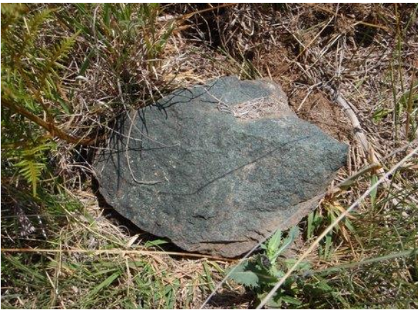
Greenstone from Mt William Aboriginal quarry